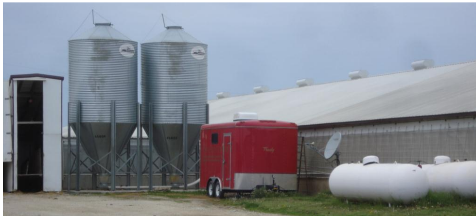
Figure 1. Schematic layout of air sampling ports in the deep-pit swine facilities monitored and a photo of the mobile air emissions monitoring unit (MAEMU) installed at the site.